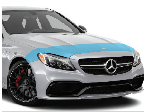
Partial Hood and Fender

Clear gloss polyurethane for stone chip protection, high wear, and abrasion in the automotive, motorcycle, RV, powersports, bicycle, aircraft, and other transportation markets.